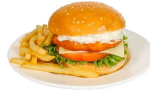
Fish Burger $6.00

Coconut rice with chicken wings, sunny side up egg, cucumber, sambal, peanuts, and anchovies