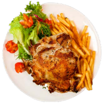
Pan Grilled Chicken Chop $9.90

Pan grilled chicken chop with Meslun salad, French fries and Black pepper sauce.