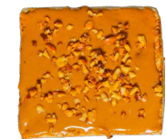
Creamy Peanut Toast