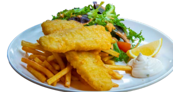
Fish & Chips $9.90

Flaky roti prata served alongside a rich and flavourful curry dhal.