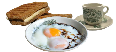
Toast with Half-boiled Eggs + 1 Kopi / Teh $5.00