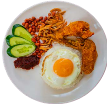
Signature Nasi Lemak $7.90

Pan grilled chicken chop with Meslun salad, French fries and Black pepper sauce.