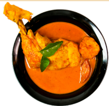
Curry Chicken $8.00

A spicy coconut noodle soup with thick rice vermicelli, served in a rich and fragrant gravy.