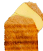
Butter Sugar Toast