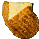
Kaya Butter Toast