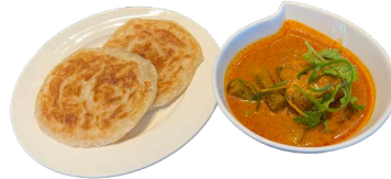
Roti Prata with Curry Dhal $4.00

Chicken in a fragrant curry sauce, paired with the choice of rice or baguette.